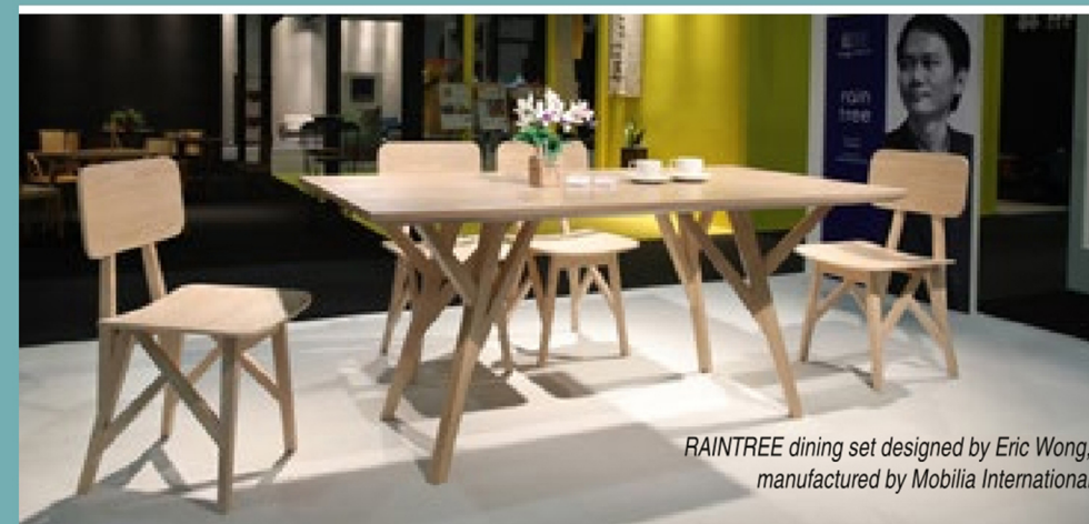
RAINTREE dining set designed by Eric Wong, manufactured by Mobilia International