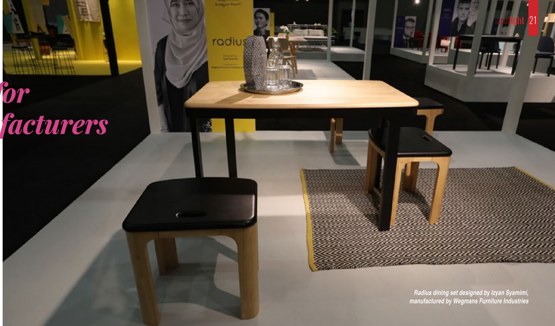
Radius dining set designed by Izyan Syamimi, manufactured by Wegmans Furniture Industries

MTIB has also launched TANGGAM Design Centres in Kota Damansara, Johor Bahru, Kota Kinabalu and Kota Bharu. Through projects that are self-initiated or developed in collaboration with the industry, these centres aim to develop new design methods for multidisciplinary collaboration among participants from different disciplines.