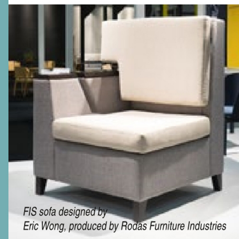
FIS sofa designed by Eric Wong, produced by Rodas Furniture Industries